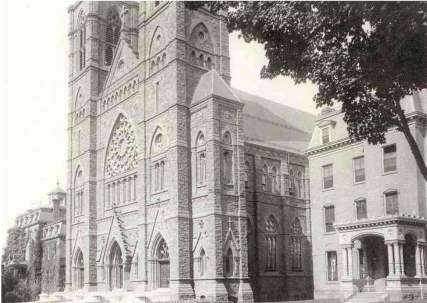
St. Joseph's Cathedral circa 1892