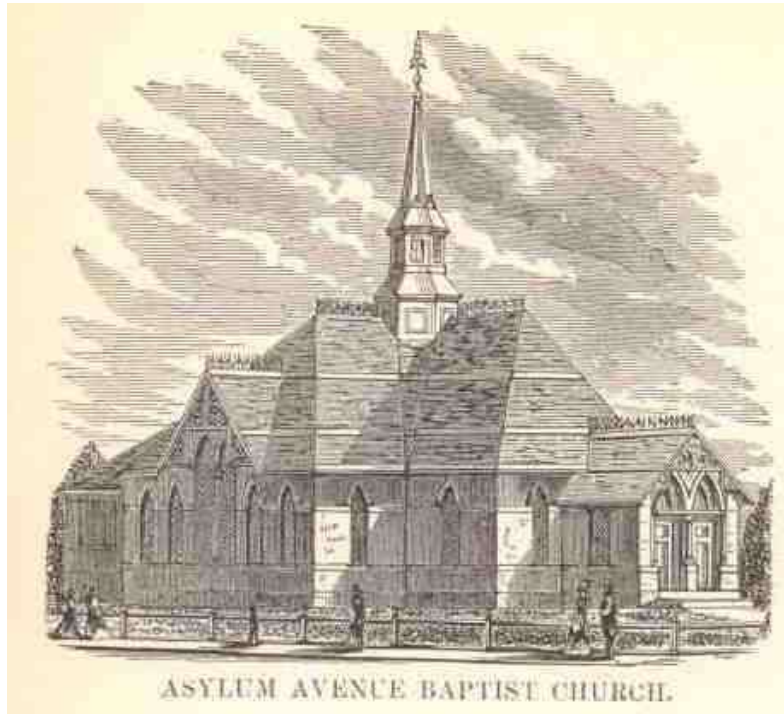
As originally built 1872