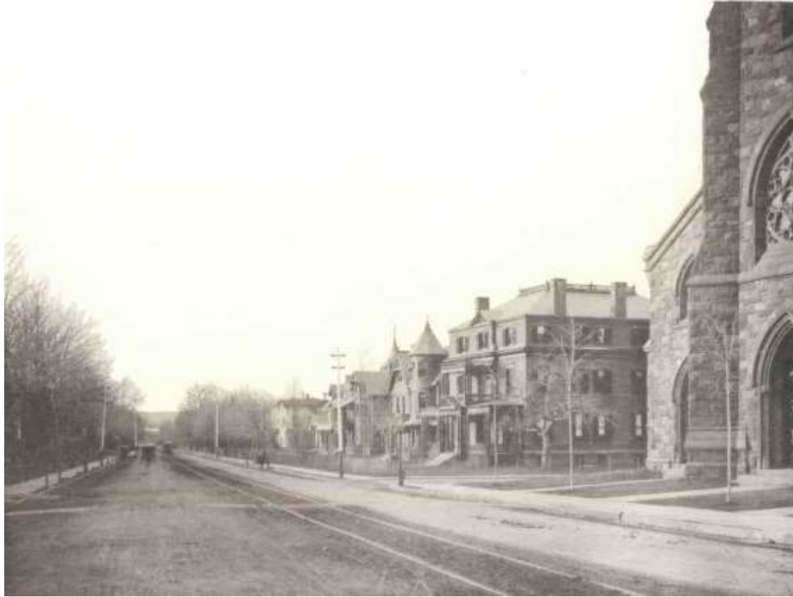
Asylum Avenue looking west (circa 1890) Asylum Hill Congregational Church foreground right