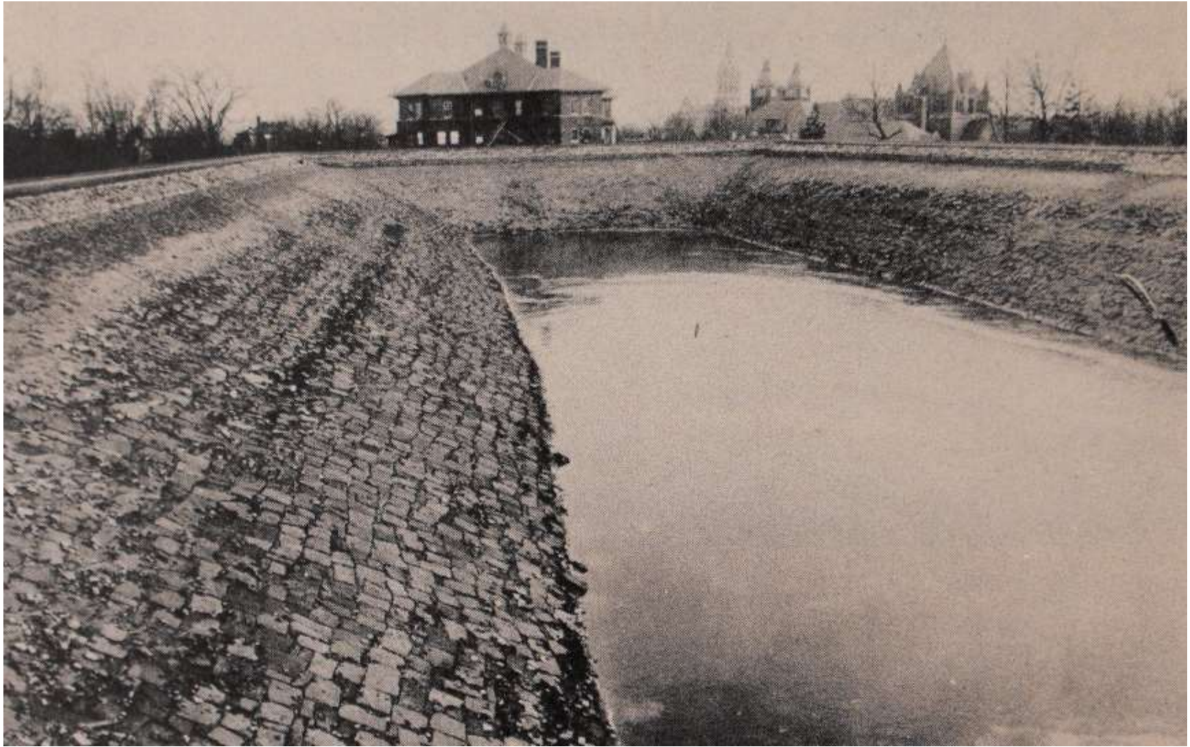
Lord's Hill Reservoir (Cogwells Hall/American School for the Deaf in background)